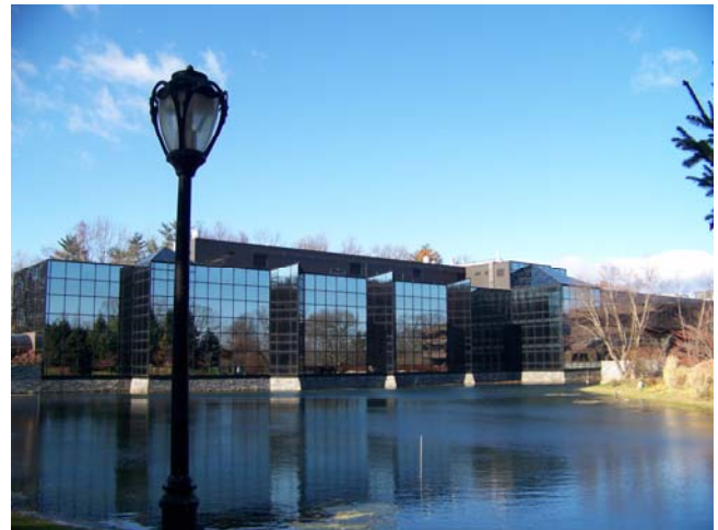
MBIA, Armonk, NY (Office Headquarters)