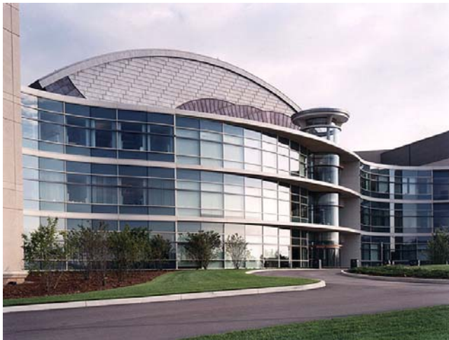
Pfizer PGRD, Groton, CT (Laboratory & Office Space)