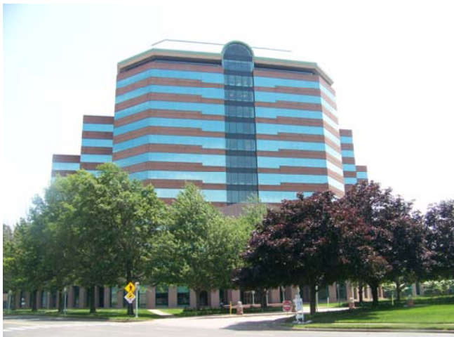
Long Wharf Maritime Center, New Haven, CT (Multi-Tenant Office)